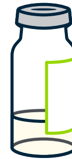
10-mg/1-mL multiple-dose vial

Only use the number of doses per vial as listed in this table. Dispose of any leftover medicine.